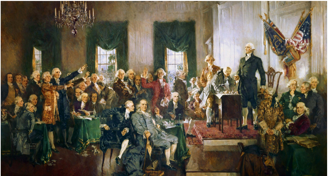
Painting by Howard Chandler Christy, Scene at the Signing of the Constitution of the United States