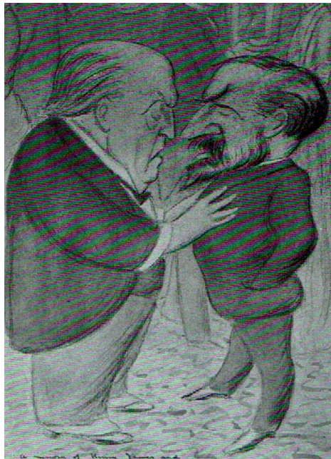
Henry James and Joseph Conrad conversing at an afternoon party, by Max Beerbohm.